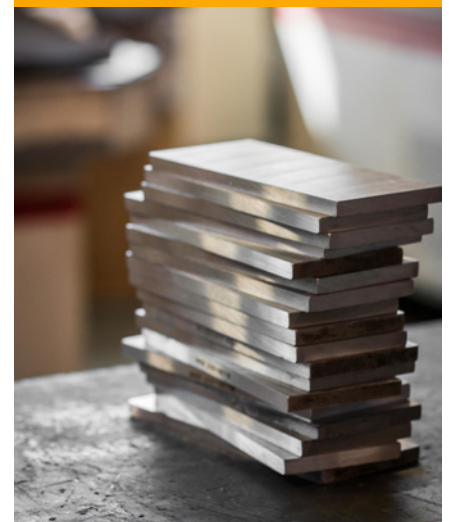
Series of steel plates

At Froidevaux, change is afoot but continuity is guaranteed with Didier Froidevaux leading the company. It is essential to conserve the valuable stability developed over the years, while remaining innovative and turned to the future. “We are close to our clients and